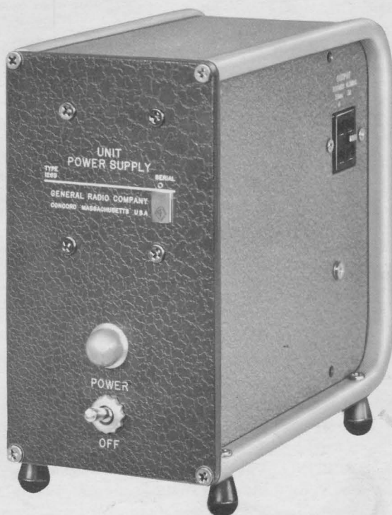
Figure 1. Type 1269-A Power Supply.